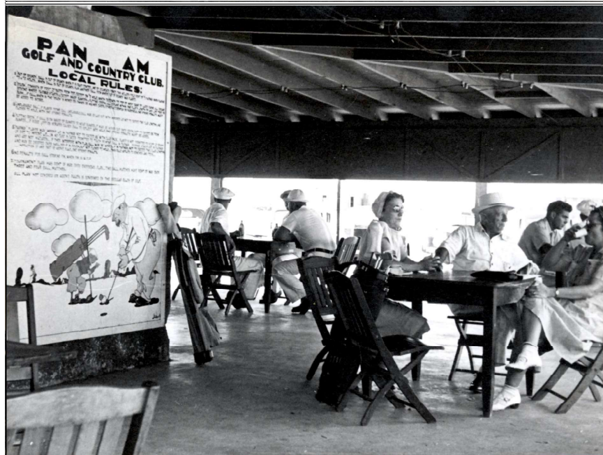
Above, top: The colony Library. Above, bottom: The colony Golf & Country Club. (Both early 1940's)