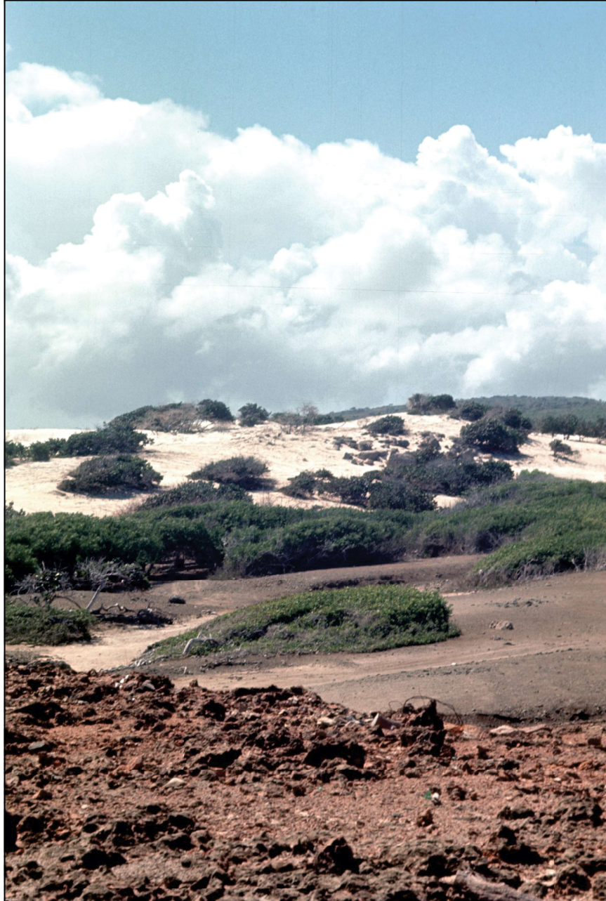
Lawrence of Aruba? Sand dunes in 1964.