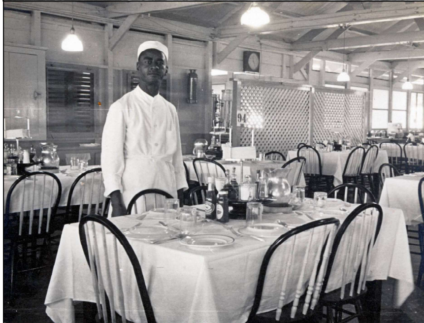
Above, top: Boca Prinz. Above, bottom: Inside the company Dining Hall. (Both early 1940's)